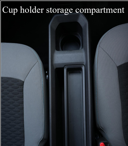
Cup holder storage compartment