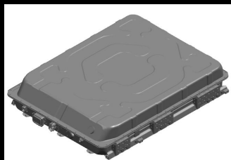
Powered by CATL batteries: delivering high quality, safety, and stability.