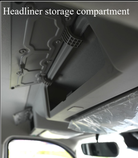
Headliner storage compartment