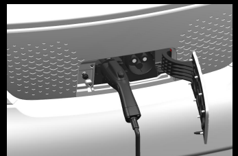
Efficient fast charge + home slow charge: Dual charging ports with dual temperature control protection.