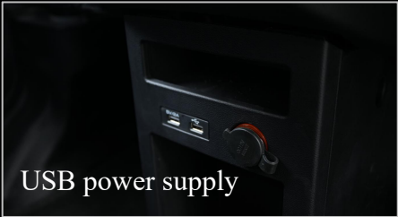
USB power supply