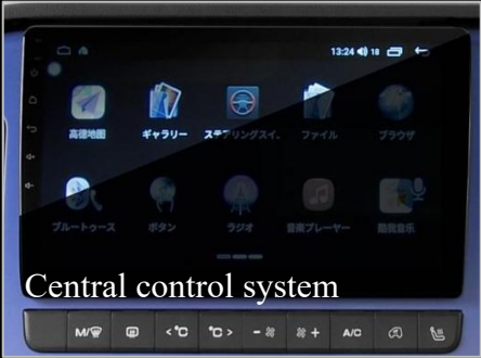
Central control system

Compact and intelligent cockpit design for a more user-friendly experience. Pure electric driving with simple and enjoyable operation.