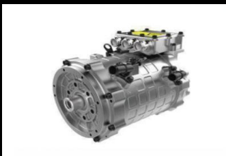
30 kW Peak Power Motor: Quick Acceleration, Powerful Performance.