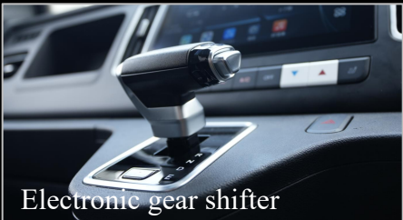
Electronic gear shifter