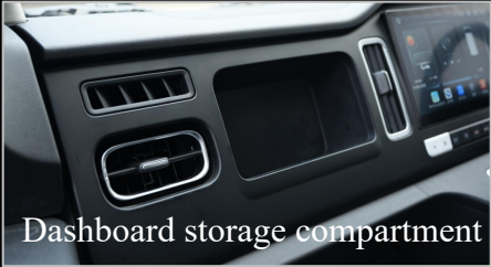
Dashboard storage compartment